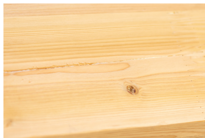
CLT with LotusPro™ water repellent coating