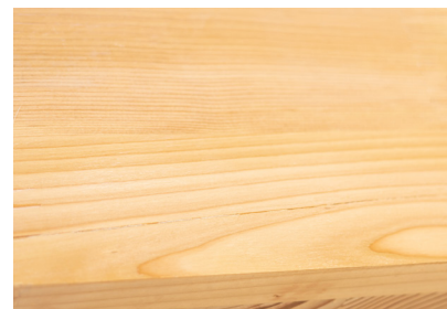
CLT with LotusPro™ water repellent coating with highly compatible Minwax Polycrylic