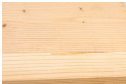
CLT with no water repellent coating

LotusPro™ water repellent appears on the wood as a bright finish so the mass timber retains its natural color and overall appearance. It is compatible with oil-based and some water-based finishes.