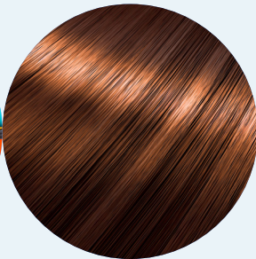
Home & Personal Care