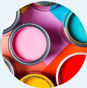
Paints & Coatings